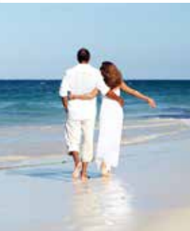
The Liberals and taxpayer funds are not a perfect couple.

In addition, around $900,000 was defrauded from the Human Services' portfolio under the Liberal's watch, with a further $100,000 across remaining Departments.