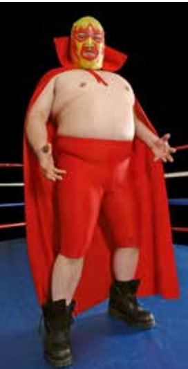
Liberals wrestle for Ministerial positions.

The Government has admitted around $30,000 was spent updating business cards, letterhead, signage and websites following the Turnbull coup and Ministry appointments.